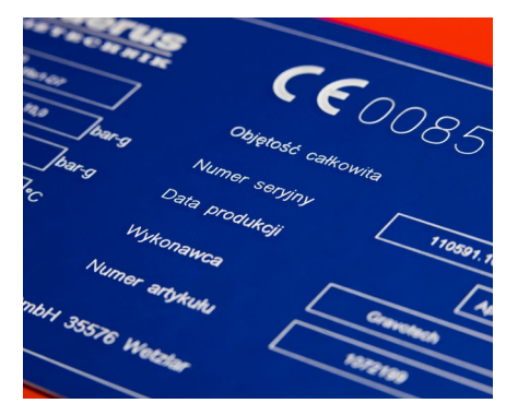
Traceablity of industrial parts