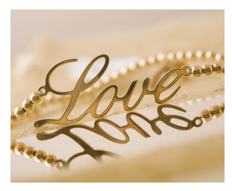
Cutting & engraving