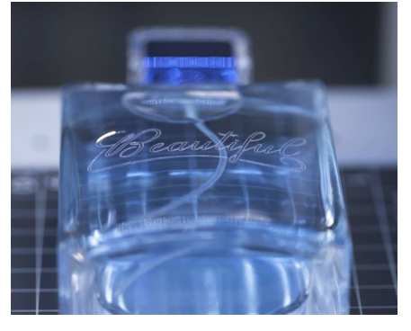
Cosmetics & luxury