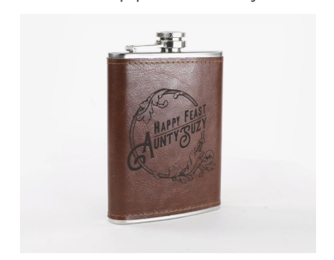
Gifts & personalization