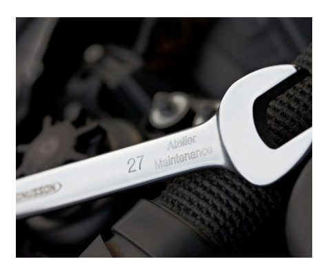
Marking tools for identification and equipment traceability